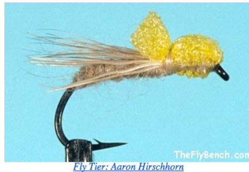
TheFlyBench.com Fly Tier: Aaron Hirschhorn

Hook : Daiichi 1180 # 14 - 20 Thread : Uni-Thread 8/0 Tan Body : Dryfly Dubbing Color to Match Natural Thorax : Dryfly Dubbing Color to Match Natural Wing : Elk Body Hair Natural Wing Case : Closed-Cell Foam Yellow