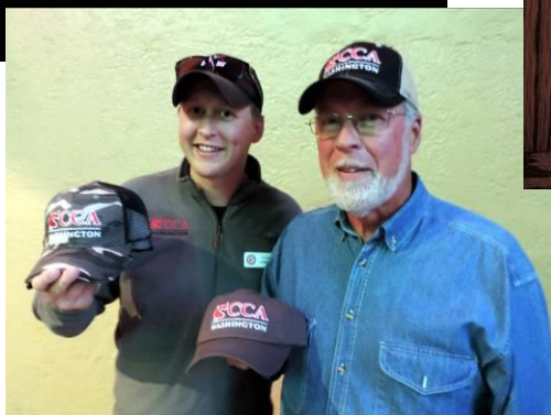
Film Festival Photos